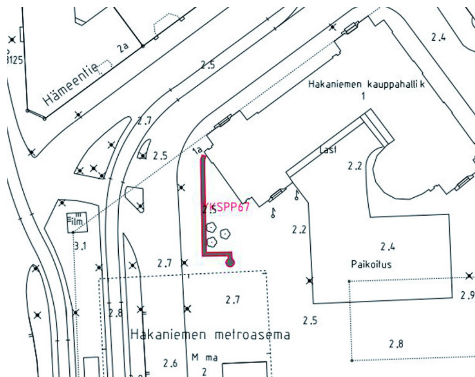
Figure 3. The same project as in Figure 1, showing the stripped base map with the project.

included in the municipal GIS. Local service for local projects seems also beneficial in comparison to centralized services. Open internet service may not be possible either, because infrastructure information is sensitive for common safety reasons. The state authorities seem to prefer one centralized service, which should be Johtotieto Oy.